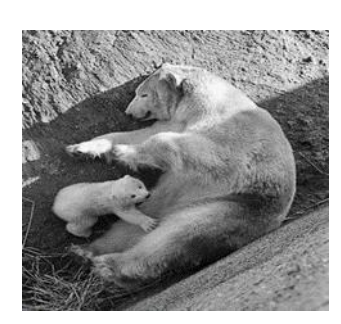
Brumas & Ivy

Brumas was the first baby polar bear successfully reared in the UK. He was born in London Zoo in 1949 and the nation was fascinated by him – over 2 million visitors went to see him. Soft toys and books followed.