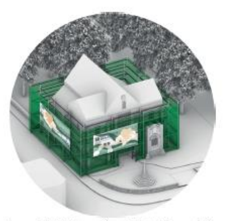
Image 1: Artist's impression of the Gatehouse during repairs with banners linking to further information.