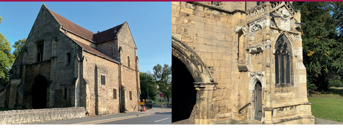
The rear of the Gatehouse as seen from Priorswell Road